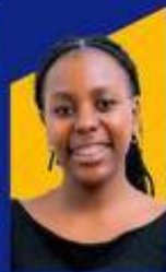
Sinegugu Shongwe University of KwaZulu-Natal South Africa

Building on the success of Cohort 1, the American Institutions for Research (AIR) Grant Cohort 2 program deepened UAPS's investment in nurturing the next generation of African population scientists. The program supported 10 exceptional UAPS AfRes-Data Fellows from seven African countries, including Nigeria (3), Cameroon (2) and one each from Ghana, Malawi, Ethiopia, Burkina Faso, and South Africa. The partnership also provided travel grants to 13 ECRs from seven African countries to attend the in-person workshop in Kenya. The workshop was held on August 11–15, 2025.